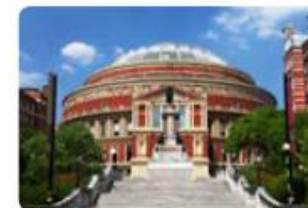
Royal Albert Hall